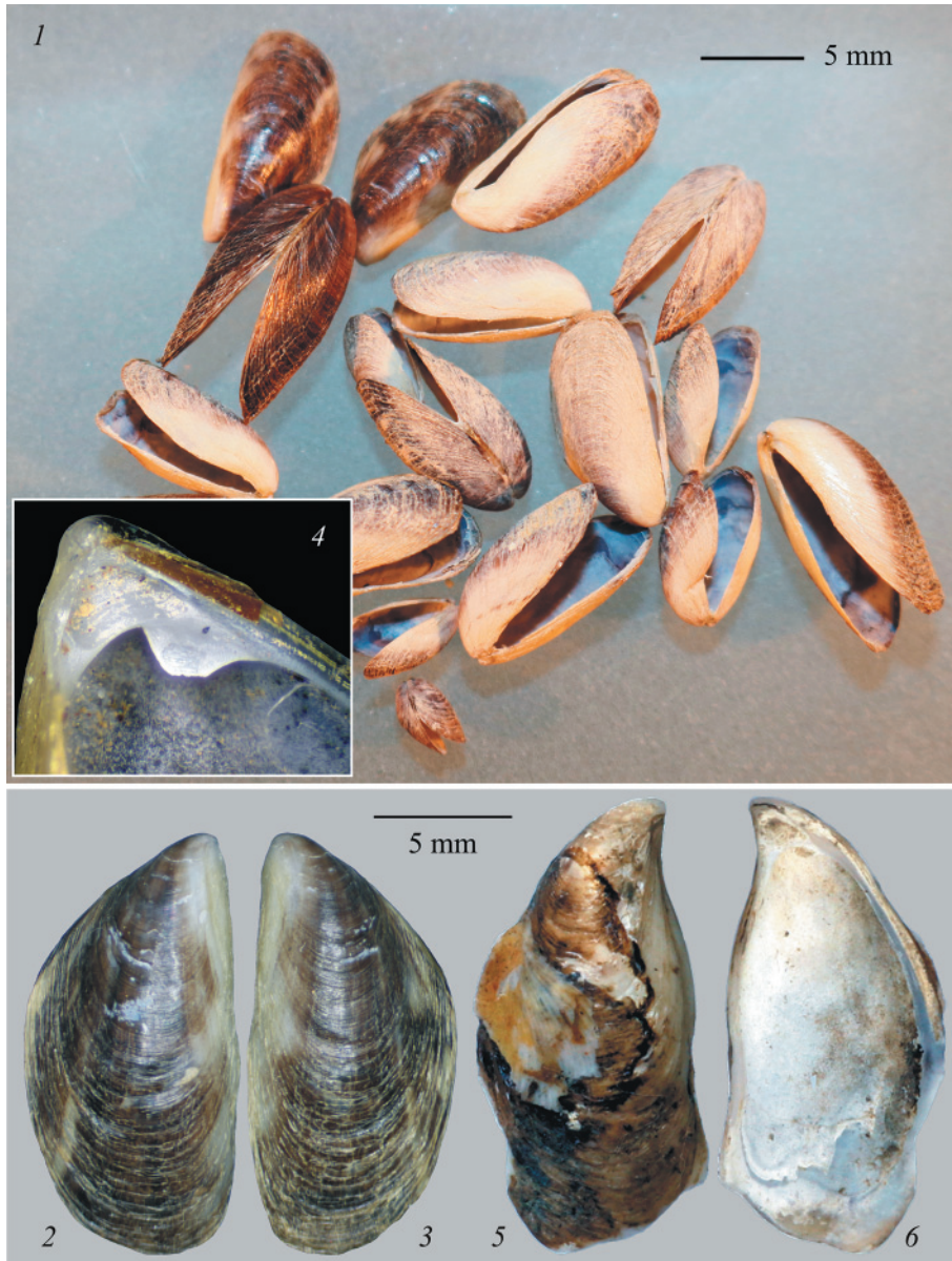
Fig. 2. Mytilopsis leucophaeata : 1 — shells from Patara Paliastomi Lake (locality 2); 2–4 — whole specimen from the same locality (2 — right valve, 3 — left valve, 4 — enlarged inner view of position 2 showing the apophysis); 5–6 — a single right valve of shell from Shaori Reservoir (locality 3) from outside (5) and inside (6) views correspondingly.

Dreissenid species Mytilopsis leucophaeata was reported from Europe as early as 1835 (Nyst, 1835; Verween et al., 2005) and now is widely spread in west European countries (Heiler et al., 2010; Dziubińska, 2011). M. leucophaeata became significant pest in some parts of invaded areas while in native habitats it is usually uncommon (see Kennedy, 2011). East European regions and in particular Ponto-Caspian basin were occupied relatively recently by this species. It was firstly discovered in 1996 in the northern Caspian Sea (as