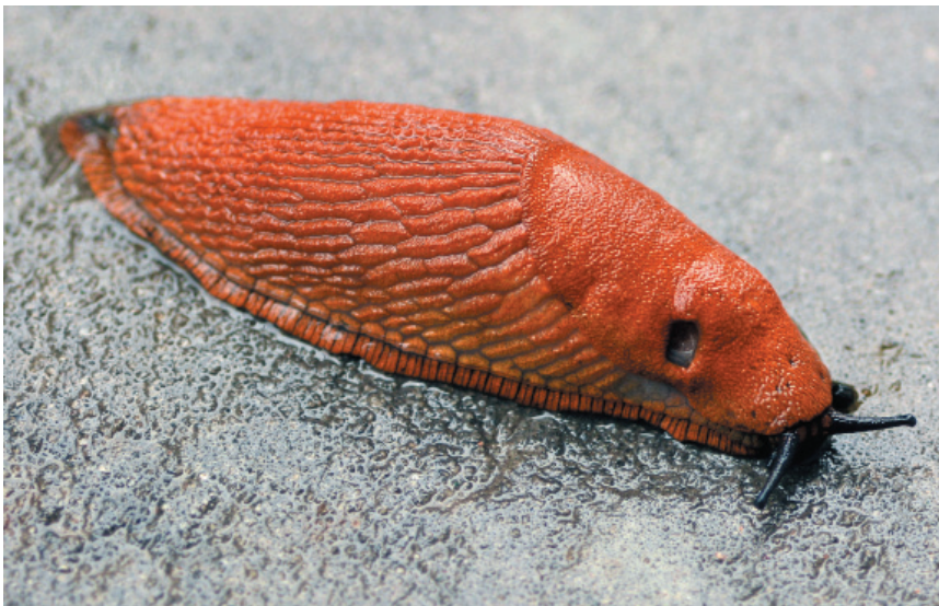
Fig. 1. Spanish slug from Kyiv, August 2017.

Received data (fig. 2) suggests wide distribution of the Spanish slug across Ukraine. Probably this species also occurs in other settlements of Ukraine and should be expected to occur on all territory, as well as in all adjacent countries.