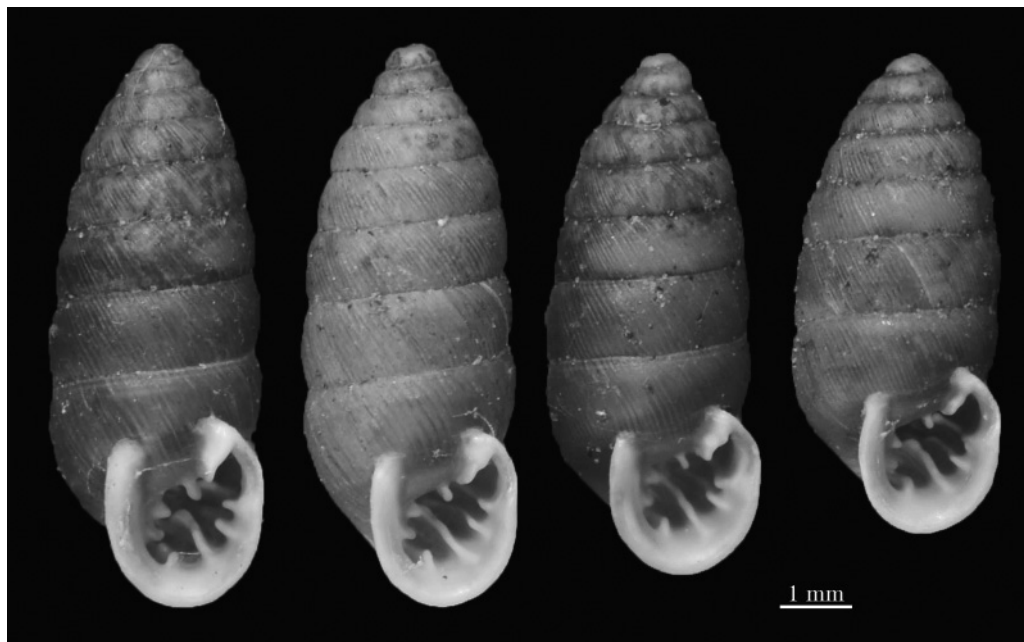
Fig. 2. Shells of Granaria frumentum from the vicinities of Korsun-Shevchenkivskiy town.

The vegetation of the plot was feather grass steppe vegetation without granite rocks, with Stipa capillata L., Festuca valesiaca aggr., Salvia nemorosa L., Poa angustifolia L., Medicago falcata L., Galium verum L., Artemisia marschalliana Spreng., Seseli tortuosum L., Thymus marschallianus Willd., Bromopsis inermis (Leys.) Holub, Allium sp., etc., with rich moss cover.