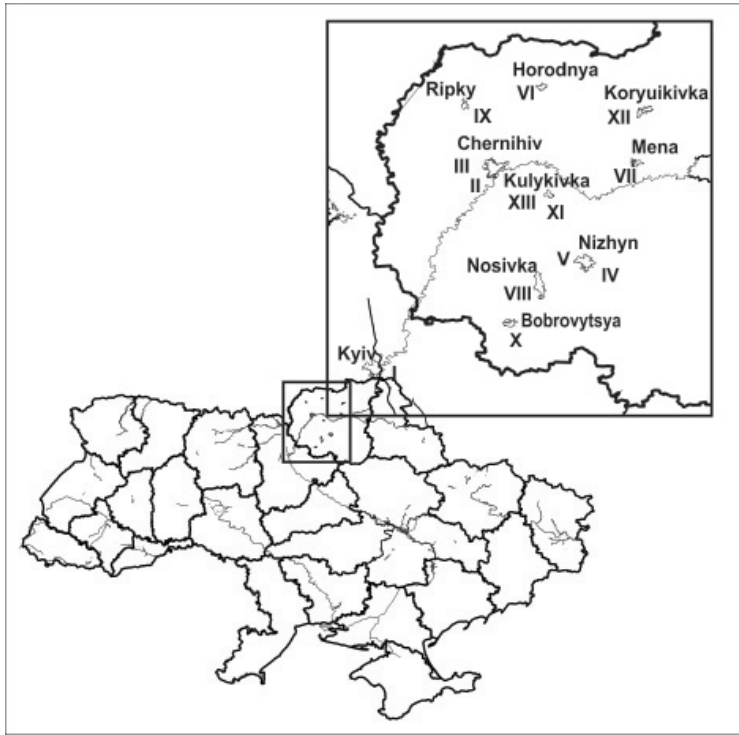
Fig. 1. Region of investigations.