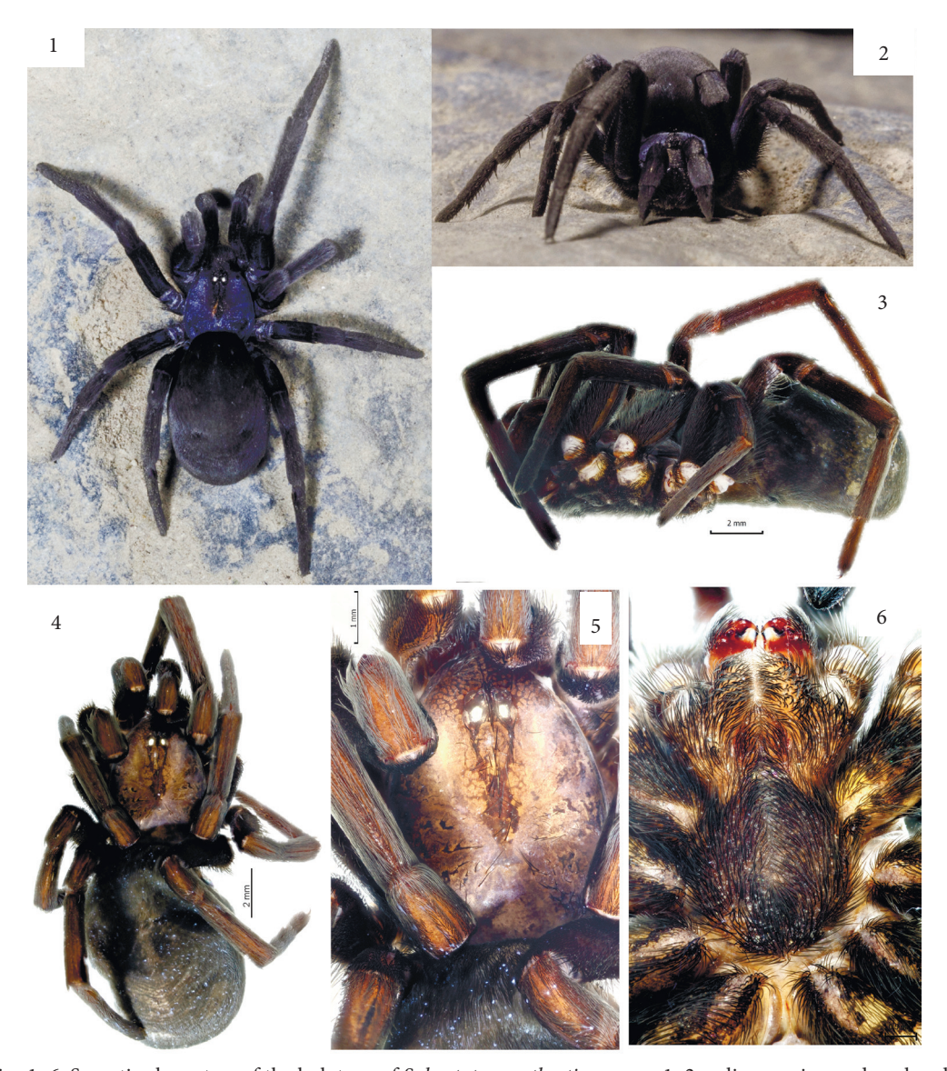
Figs 1–6. Somatic characters of the holotype of Sahastata amethystina sp. n.: 1–2 — live specimen, dorsal and frontal; 3–4 — preserved specimen, lateral and dorsal; 5–6 — prosoma, dorsal and ventral. Photographs 1–2 after Ali Mohajeran.

(Marusik et al., 2014: figs 26–29, 32, 33), and the complex shape of the receptacles, each having three distinct parts (globular or with two heads in sibling species, Marusik et al., 2014: figs 34–41).