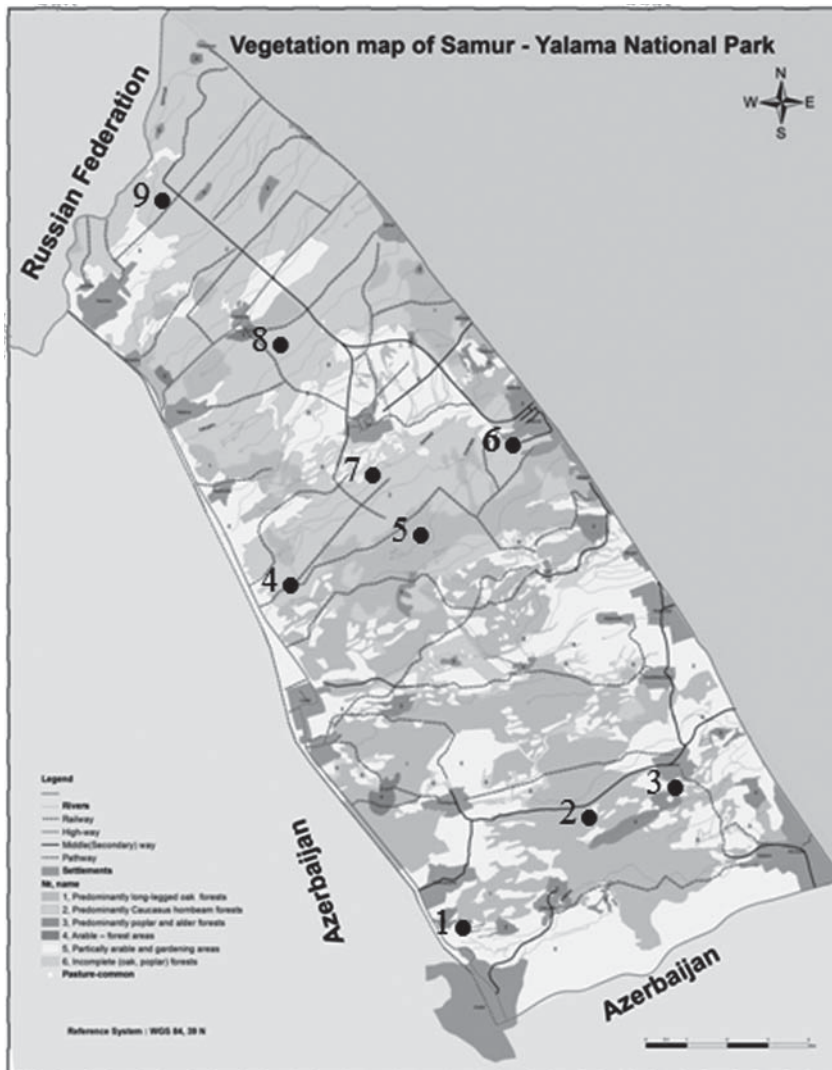
Fig. 1. The soil sampling points in the Samur-Yalama National Park.

of the human factor. In these sampling sites, 95, 85, 97, 100, and 91 species of pedobiont ciliates were observed, respectively. It should also be noted that in addition to rich diversity of species in these sample sites, more rare stenobiontic species that are not characteristic for human influence areas were found there. Colpoda lusida , C. orientalis , Placiocampa difficilis , P. incisa , Urotricha atypica , Birojimia terricola , Nassula terricola , Colpidium singular are as examples of such ciliate species.