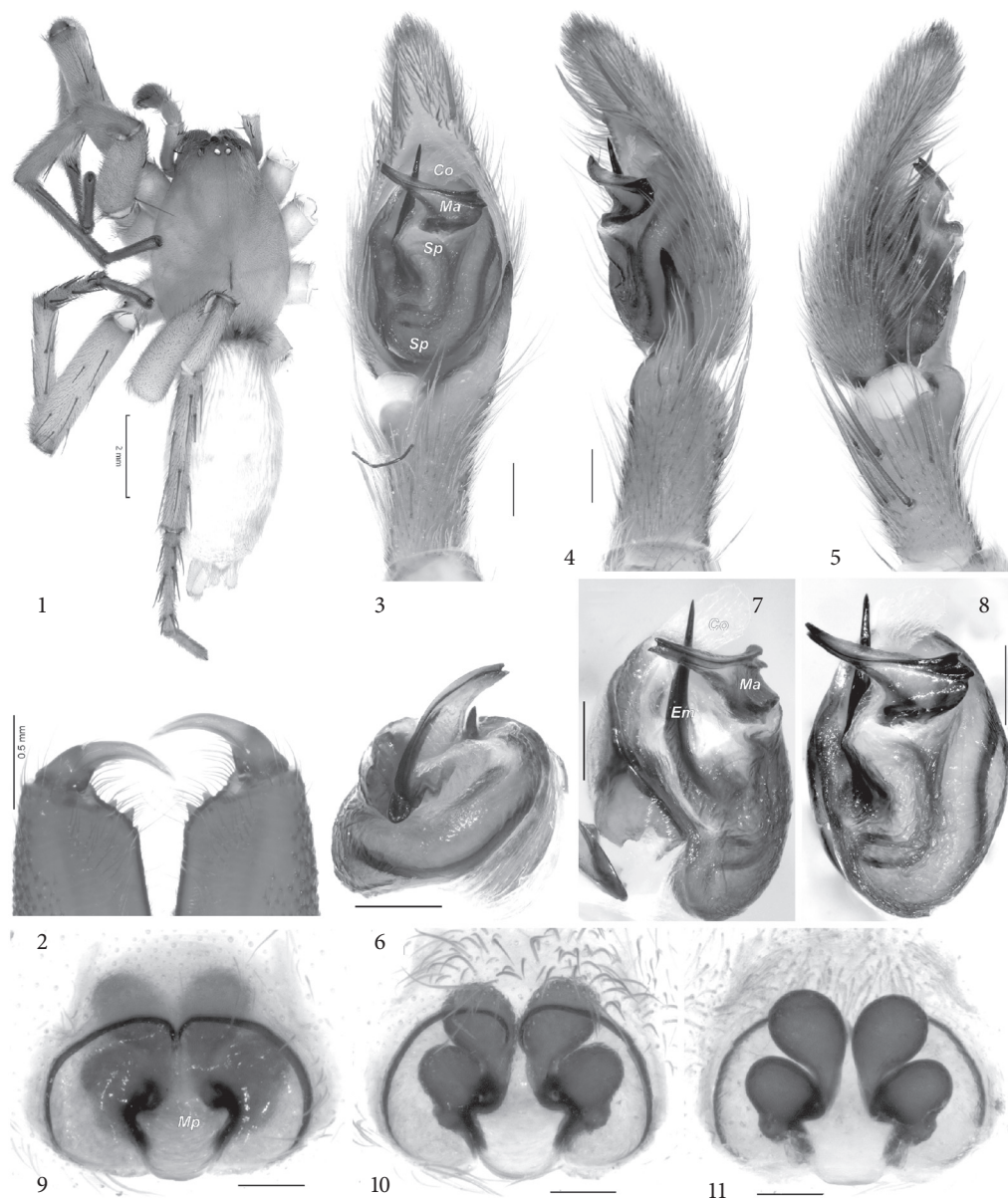
Fig. 1–11. Diagnostic characters of Drassodes kaszabi : 1 — male habitus, dorsal; 2 — male chelicera, posterior; 3–5 — male palp, ventral, retro- and pro-lateral; 6–8 — bulbus, dorso-retrolateral, pro-lateral and ventral; 9–10 — epigyne, ventral; 11 — epigyne, dorsal. Scale bar 0.2 mm if not otherwise indicated.

Diagnosis. Males of D. kaszabi are similar to those of D. pubescens (Thorell, 1876), D. dispulsoides Schenkel, 1963 and D. cupa Tuneva, 2005 in having a modified median apophysis (transverse, with bifurcated tip) and a straight embolus, differing from these two species by having a long tibial apophysis, almost as long as the palpal tibia (2 or more times shorter in similar species). The tibial apophysis of D. cupa is sharply pointed, but it is not in