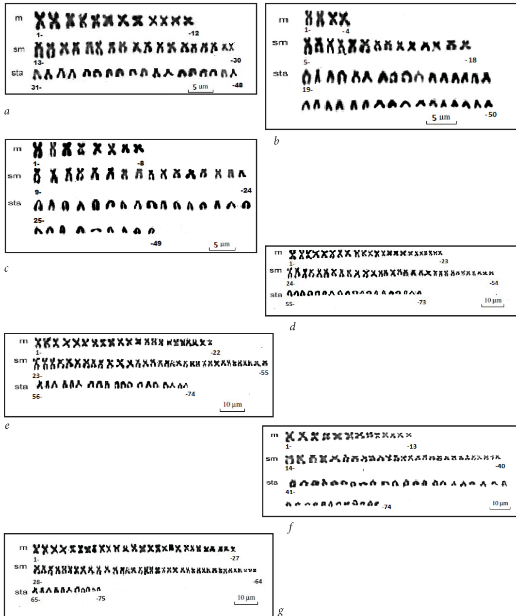
Fig. 1. Karyograms of spined loach species and biotypes studied: a — C. taenia , the channel, the basin of the Sluch River; b — S. aurata , Guiva River, the basin of the Teteriv River; c — C. taenia × S. aurata , Guiva River, the basin of the Teteriv River; d — C. elongatoides — 2. taenia , Guiva River, the basin of the Teteriv River; e — C. elongatoides — tanaitica — taenia , Guiva River, the basin of the Teteriv River; f — C. taenia — C. tanaitica — S. aurata , Guiva River, the basin of the Teteriv River, the channel, the basin of the Sluch River; g — C. 2 elongatoides — tanaitica , the channel, the basin of the Sluch River (m — metacentric; sm — submetacentric; sta — subtelo- and acrocentric chromosomes).