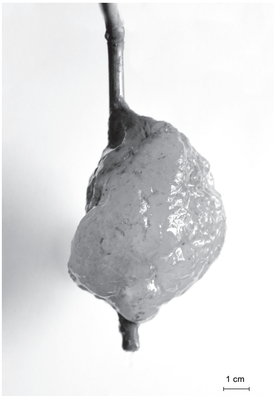
Fig. 3. General view of the colony of bryozoan Pectinatella magnifica on the reed stem from the Ukrainian part of the Danube Delta.

spinoblast features (Gontar, 2012 b). The spinoblast of P. magnifica resembles those of the Cristatellidae, such as Cristatella mucedo Cuvier, 1798. The two species can be distinguished by the anchor-like thorns occurring in two sets of rows, with 12–20 dorsal thorns and 20–40 occurring ventrally in C. mucedo (Waaij van der, 2013). P. magnifica has a single row of 11–21 thorns with a mean number of thirteen (Davenport, 1900) (fig. 2). Both species have similar statoblast shapes; the colonies of C. mucedo are relatively small, up to one centimeter, whereas P. magnifica can be up to 40 cm in extent and has a different anatomy (Gontar, 2012 b).