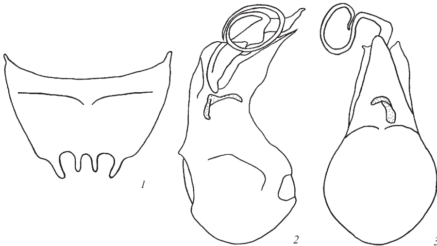
Fig. 2. Gyrophaena orientalis : 1 — 8th abdominal tergites of male; 2 — aedeagus in lateral view; 3 — aedeagus in dorsal and in lateral view; 1–3 — redrawn (after Ádám, 2008, with amendments).

The original description of G. transsylvanica is based on a single holotype male from Romania “Herkulesfürdő” and two paratypes (one male and one female) from Hungary “Hu., Bihar, Galbina, Bokor” (Ádám, 2008). Ádám (2008) compared G. transsylvanica with G. williamsi A. Strand, 1939 and G. munsteri Strand, 1935, but there was no reference whatsoever to G. orientalis ; the figures of the aedeagus of the holotype and paratype of G. transsylvanica in Ádám (2008) are rather misleading. An examination of the holotype and paratypes revealed that it is identical to G. orientalis in external characters, as well as in the shape of the male sternite VIII and in the morphology of the aedeagus. An examination