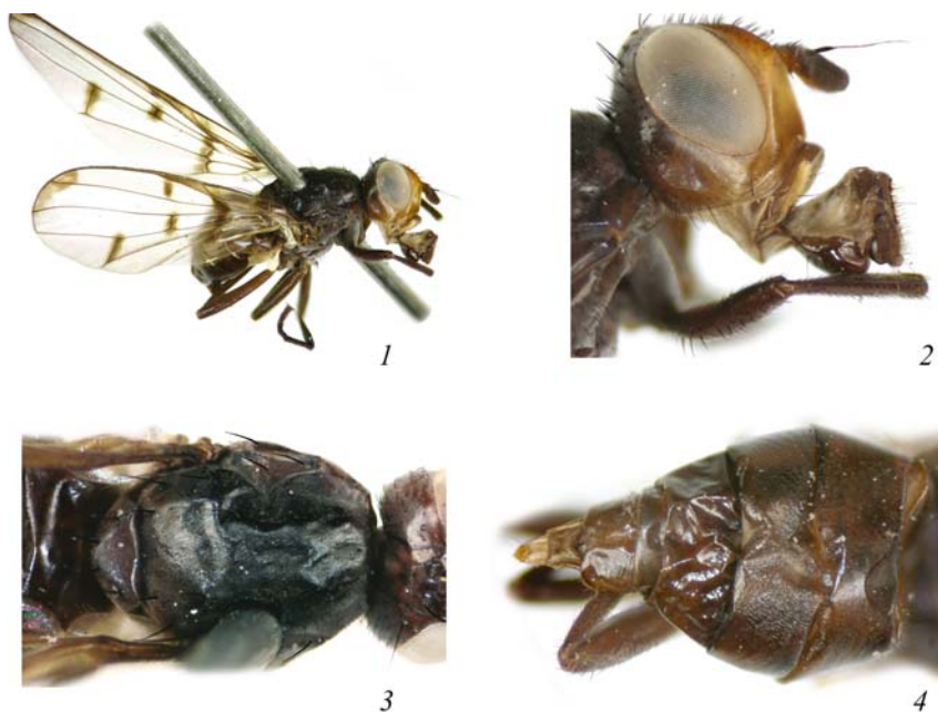
Fig. 1. Herina arjunae sp. n., holotype ♂ (1–3) and paratype ♀ (4): 1 — habitus, right; 2 — head, lateral view; 3 — mesonotum, dorsal view; 4 — abdomen, dorsal view.

Description. Head (fig. 1, 2): length: height: width ratio = 1 : 1.15 : 1.33. Frons matt, with orange frontal vitta, very narrow silver microtrichose bands along eye mar-