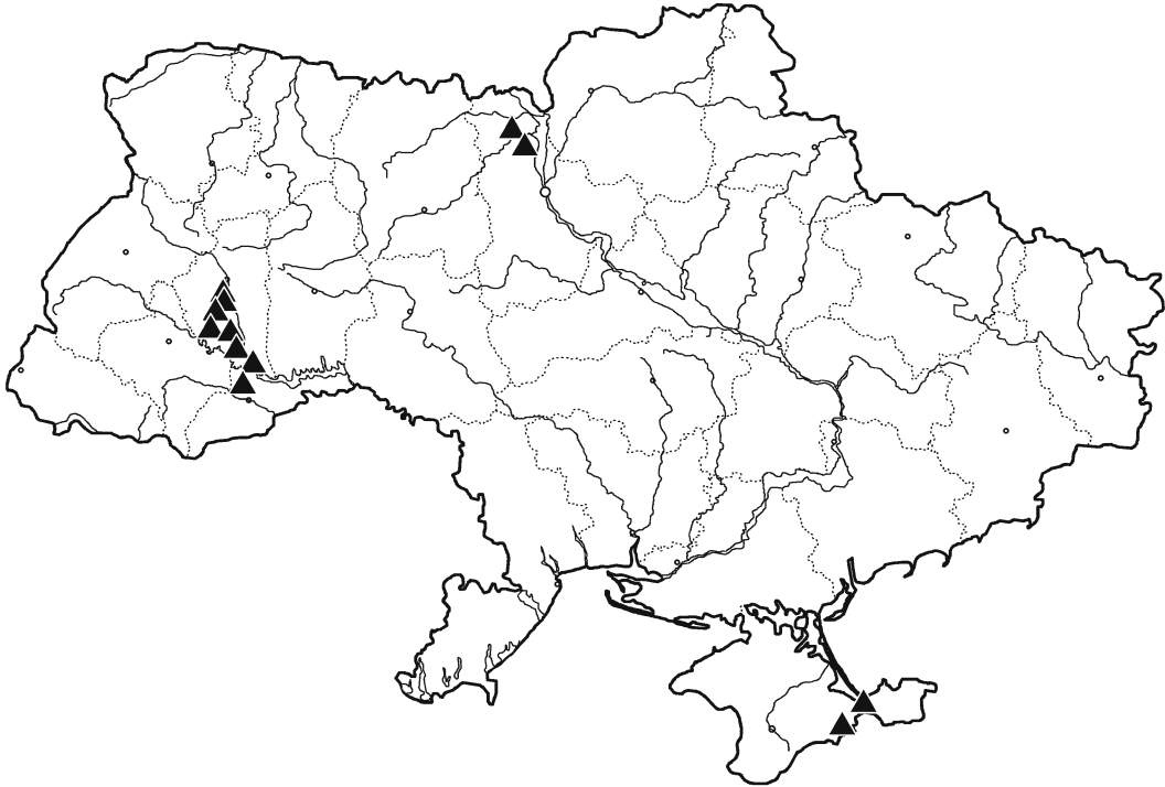
Fig. 1. Finds of O. duboisi in Ukraine.

Рис. 1. Находки O. duboisi на территории Украины.