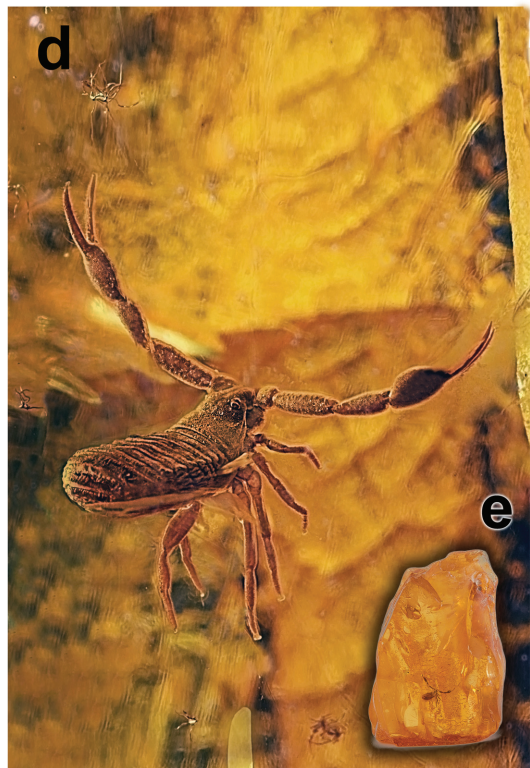
Fig. 1: a — G. gorskii , Rovno amber matrix with inclusion; b — G. gorskii , magnification of this specimen in Rovno amber, dorsal view, stacking photography in liquid; c — G. gorskii , same specimen from Rovno amber, right pedipalpal hand, anti-axial view; d — G. gorskii , well preserved specimen in Baltic amber (in coll. Henderickx); e — Baltic amber matrix of this specimen.

Рис. 1: a — G. gorskii , общий вид ровенского янтарного образца с включением; b — G. gorskii , тот же экземпляр из ровенского янтаря при большем увеличении, вид сверху, автоматический монтаж снимков в жидкой среде; c — G. gorskii , тот же экземпляр из Ровно, правая клешня педипальпы снаружи (антиаксиально); d — G. gorskii , экземпляр хорошей сохранности из балтийского янтаря (coll. Henderickx); e — общий вид янтарного образца с этим экземпляром.