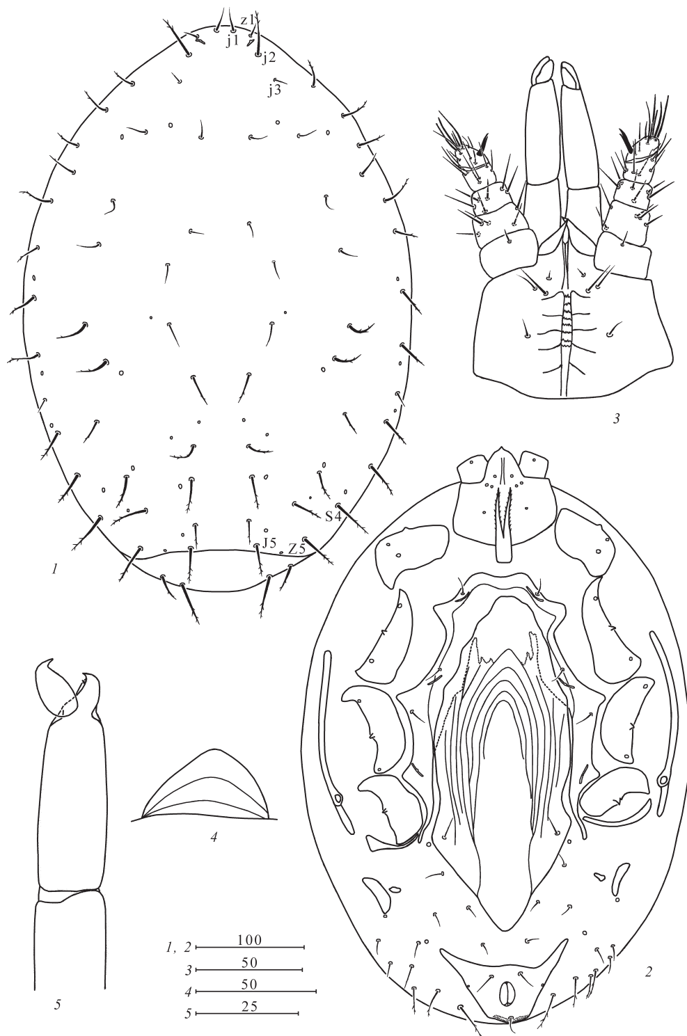
Fig. 1. Myrmozercon tauricus , ♀: 1 — idiosoma, dorsal view; 2 — idiosoma, ventral view; 3 — gnathosoma; 4 — tectum; 5 — chelicera. Values of scale bars in micrometers.

Рис. 1. Myrmozercon tauricus , ♀: 1 — идиосома, дорсально; 2 — идиосома, вентрально; 3 — гнатосома; 4 — тектум; 5 — хелицера. Значения масштабных линеек в микрометрах.