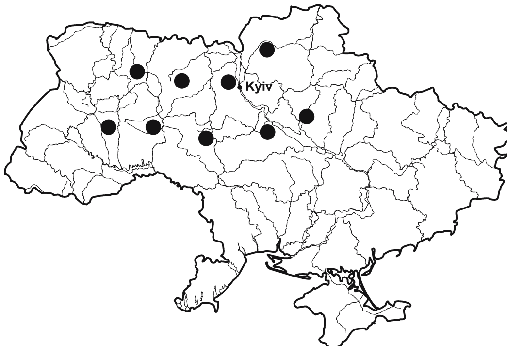
Fig. 1. Map of Ukraine showing the locality of the hunting areas studied.

Data summaries and descriptive statistic analyses were calculated using the Microsoft™ Excel.